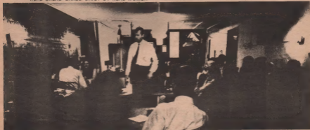
REAL PEOPLE at Paradox Restaurant a fantastic place garden open