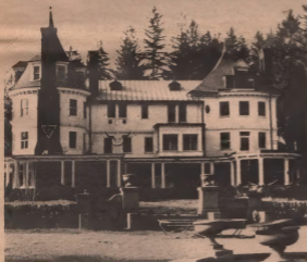
The 64-room mansion headquarters of the Castalia Foundation in Millbrook, N.Y.