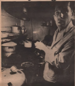
REAL INTELLECTUAL BOSS HELPING OUT IN KITCHEN