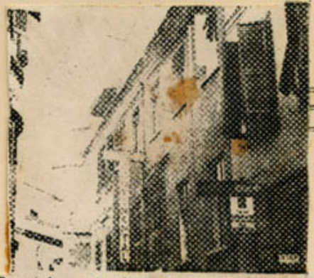
Continental Hotel Gibraltar:

suspiciously: When you are clean you are right. Spanish boy there in shorts every door guarded sweating fear like a vise the fear we all know here. Like a vise jumping at every sound from the street: 'Who's that at the door? Give him some money. Send him away. Are there any cigarettes? Will you please take a cup of tea to the workman on the roof? Sad voices dirtier older empty ugly streets of my heart to these old people they parade a queen maybe looking the boys sun beach horrible die like this no hope no hope at all. You sloppy assed