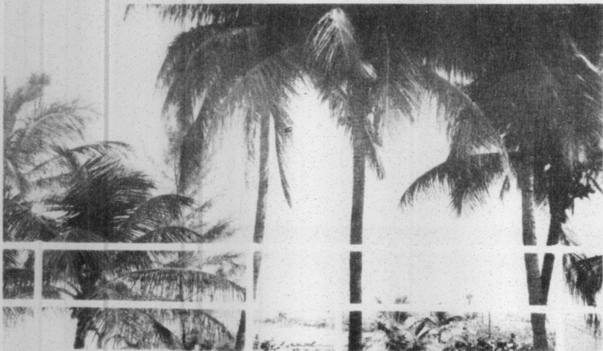
View of the Atlantic from the balcony of The Sanctuary, from which all major projections through the trinity of Sananda-Nada-El Morya now will be effected for the externalization of the Hierarchy.