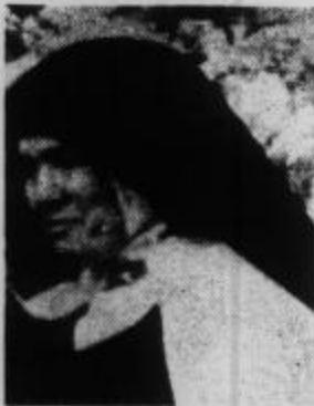
Recent photo of Sister Lucy at Fatima.

Mary had said in Garabandal in 1964-65 that she was through giving warnings, because people did not heed them sufficiently and that she already was weeping for the consequences to fall upon man "very soon."