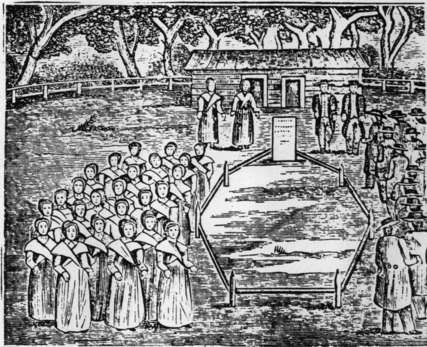
The Sacred Dance on the Holy Hill of Zion.

The Elder would sometimes kindly invite me to his room and ask me what I thought of the meeting last night. This was generally after those meetings at which there had been some great revelation from heaven, or some pow-wow with the spirits. I could only reply that I must reply that I was much astonished and that these things were altogether new to me. He would then tell me that I would see greater things than these. But I replied that it required more faith to believe them than I possessed. Then he would exhort me to 'labor for faith and I would get it.' He did not expect young believers to get faith all at once; although some got it faster than others.