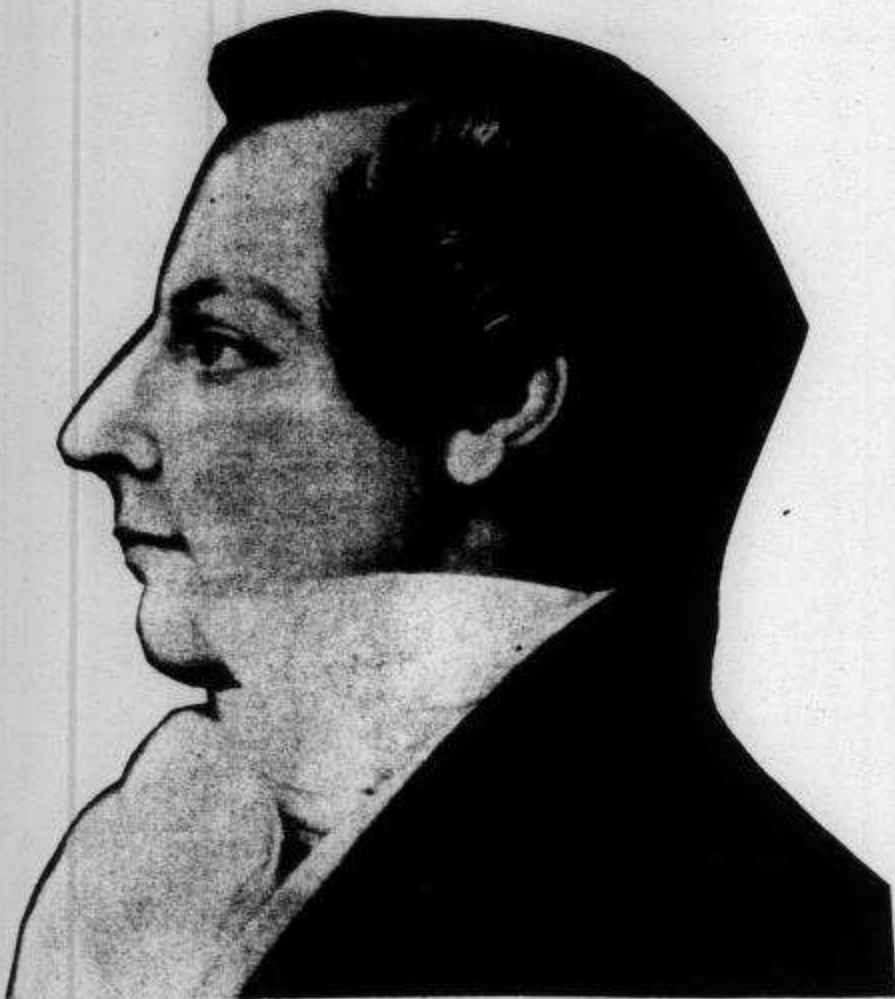
JOSEPH SMITH : the Prophet

The following selections are from the 1830 edition of the Book of Mormon printed by E.B. Grandin in Palmyra, New York.