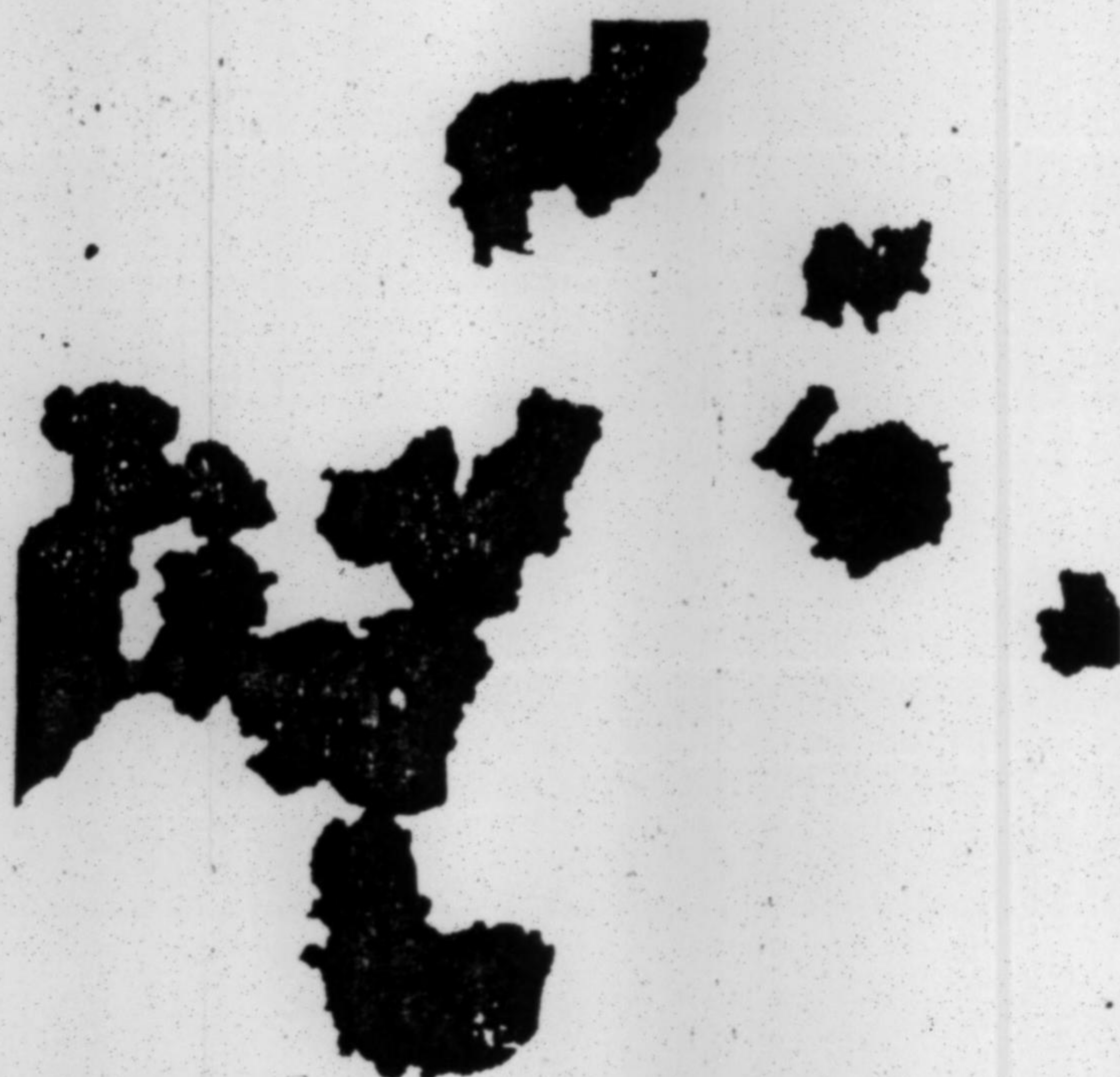
Fig. 1. Calcined gold preparation from Multan. \times 7.500 magnified.