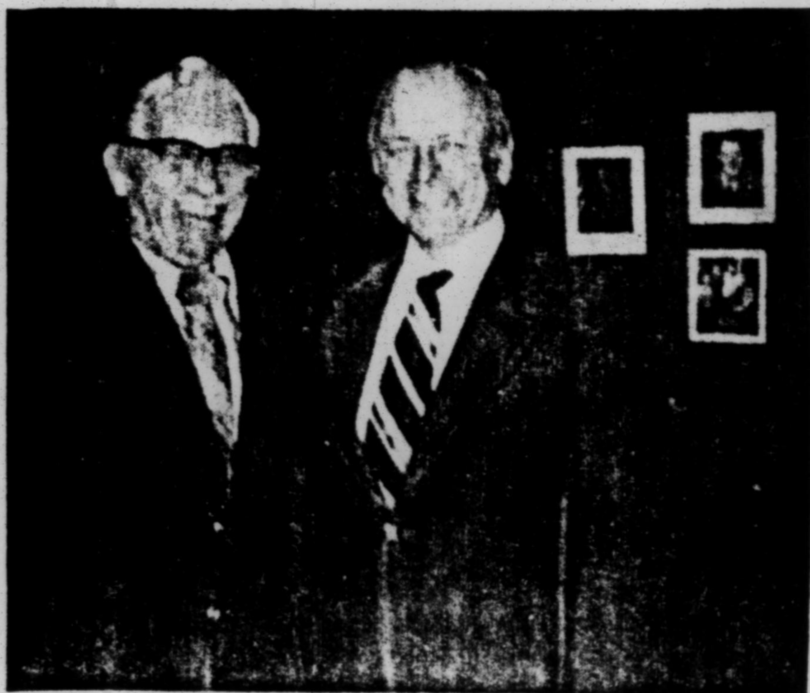
Frater Albertus and Senator Moss

On April 2, 1975 Frater Albertus met with United States Senator Frank Moss to talk about a new development originating with the PRS Research Division. This new development concerns the production of an oil from a mineral source which is found abundantly all over the globe. The yield from one ton of this mineral is approximately the same as that derived from shale oil deposits. This would be an additional source of energy in case of further restrictions or price increases on the inter-