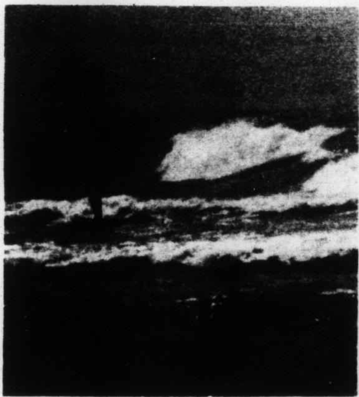
Summer Surfari Surfer