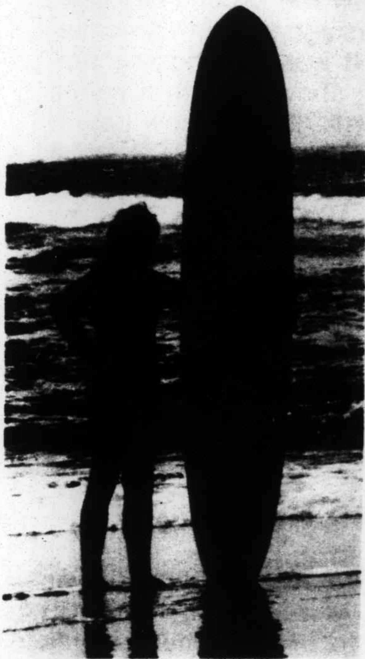
LDS Surfer with Sacred Surfboard.