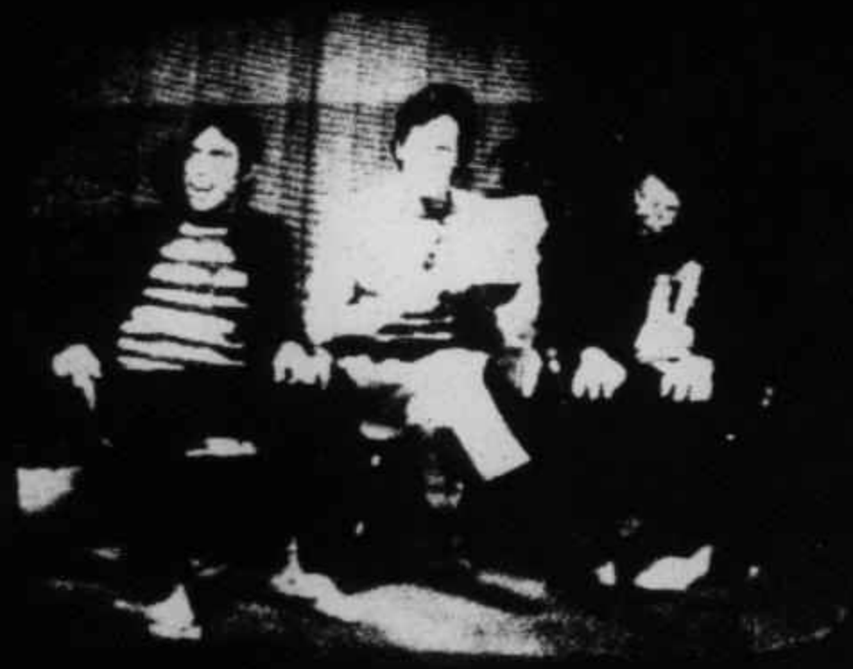
Tsunami! is offered to interested TV viewers.