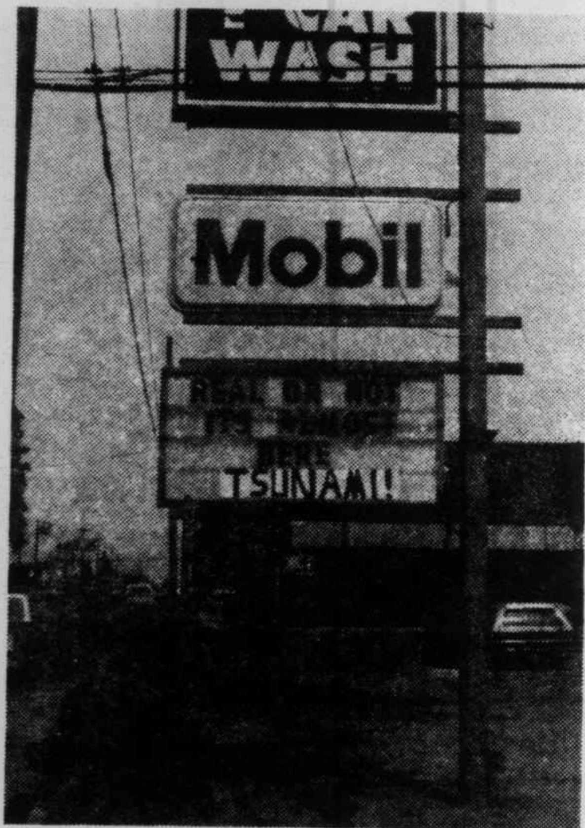
Harmless prank (not LDS)

Capt'n: If everyone Surfed, no one'd wonder who's crazy or what it means.