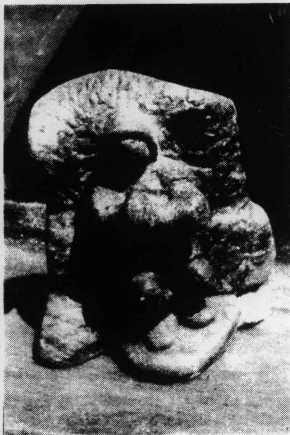
Sacred stone icon

*Jo Cook, founder of LDS, is actually female; a fact she refers to as "trivia to the Big One." ed.