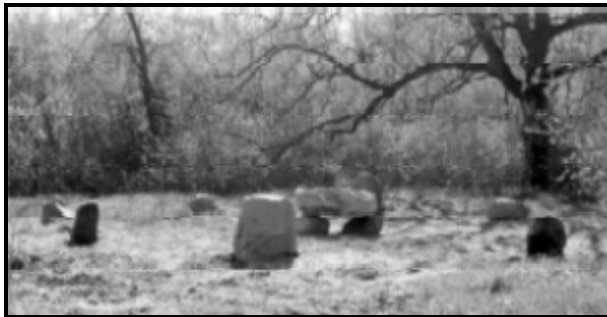
Figure 9 Old Circle c.1996 & New Circle c.1999 Very soon after both of their appearances.

EH: Is the old circle still there at all?