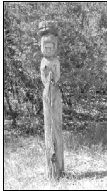
Figure 10 The Lady Statue of the Arb, c. 1995.