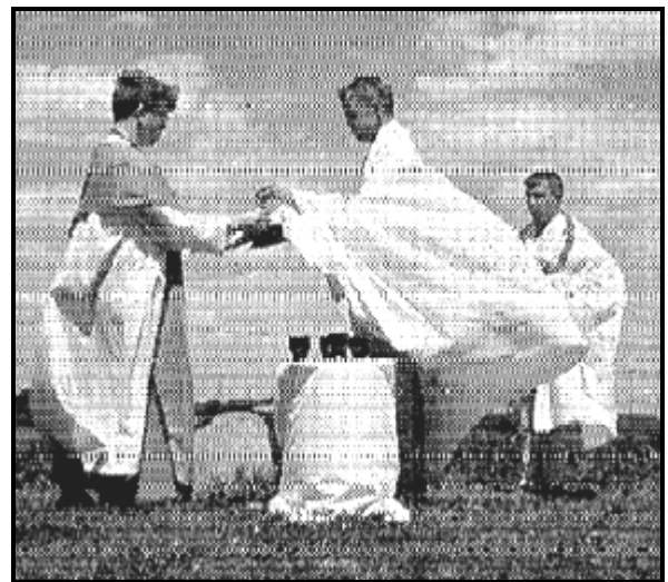
Figure 11 Nelson, Fisher & Frangquist, Hill of Three Oaks c.1964.

MS: Ok. Well I think those are the major questions I had to ask.