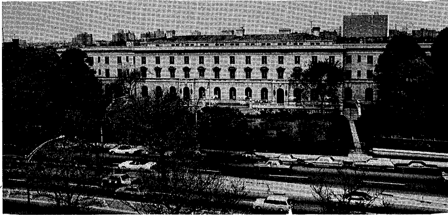
THE ANDREW FREEDMAN HOME