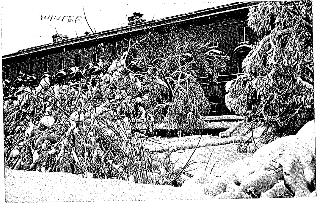
THE ANDREW FREEDMAN HOME, 1125 GRAND CONCOURSE BRONX, N. Y.—OPENED 1924