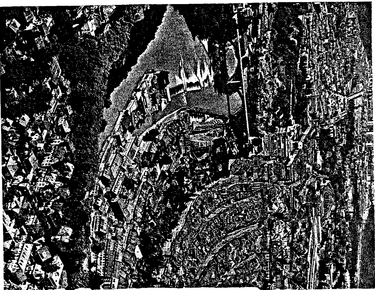
Horseshoe curve of the Aare River loops around the stately Old Town section of Bern, seat of the federal government and capital of the Canton of Bern. In a land that has historically shunned centralization of power, Bern performs its key political role