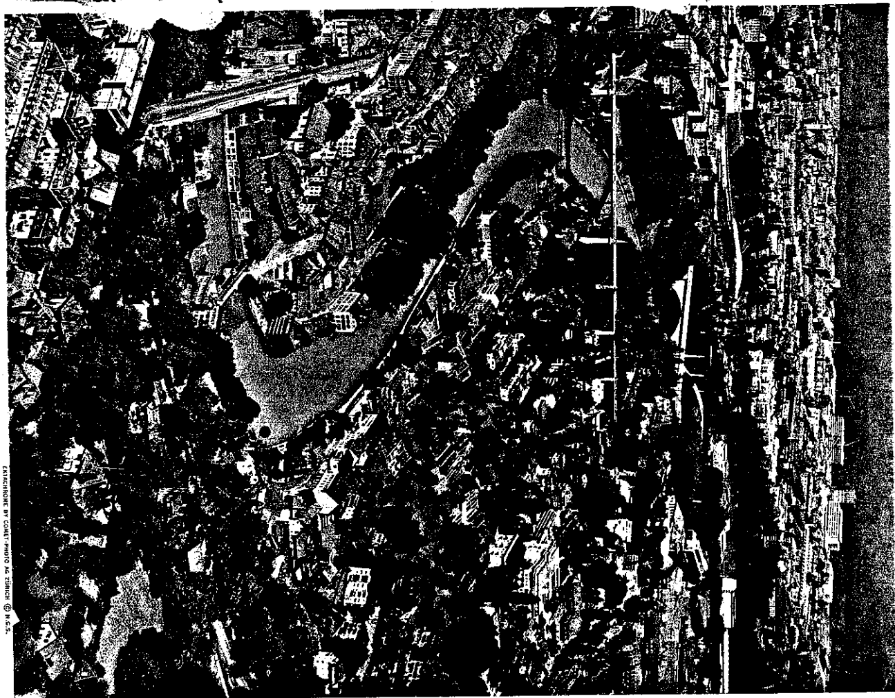
with a minimum of fanfare. The cautious Swiss, rather than have too many federal branches in one city, maintain their Supreme Court at Lausanne. Each of the 25 cantons and demarcations (map, page 72) jealously guards its autonomy and separate identity.

LAUSANNE BY GUY FERRIS & ZILBER © A.S.S.