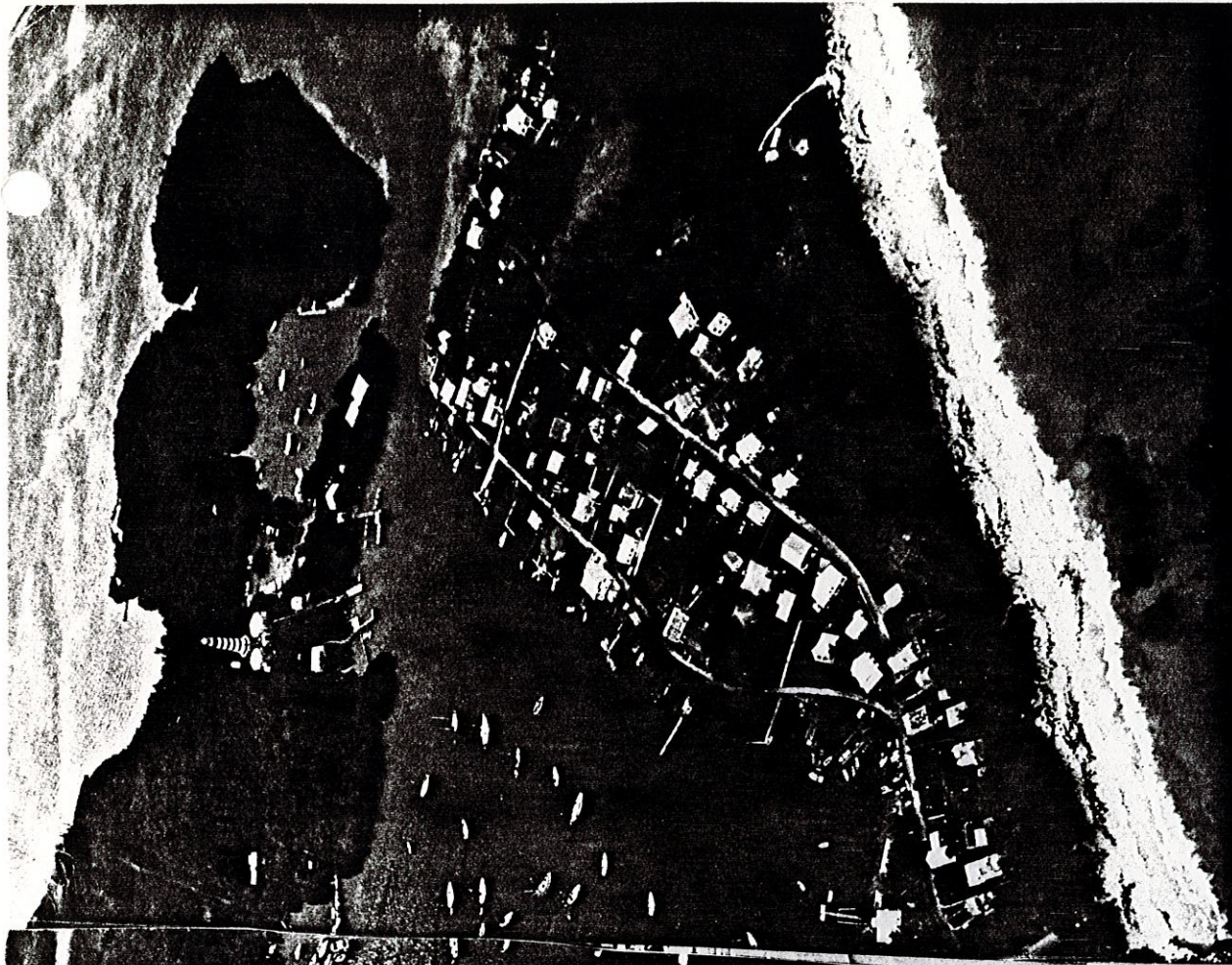
Some little touched by outsiders, others hosting small resorts. Harbors fill with pleasure boats drawn by the discovery that the Abaco cays, stretching 110 miles, enclose a virtual inland sea—among the world's finest cruising grounds.