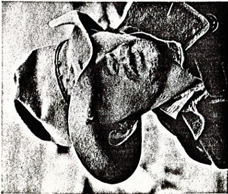
Stubble sprouts from the face of a trail-riding ranch hand during roundup. Joining a crew of wranglers in the hills, photographer Conger found them living true to cowboy tradition—riding hard from dawn to dusk, then playing poker and sipping whiskey far into the night.