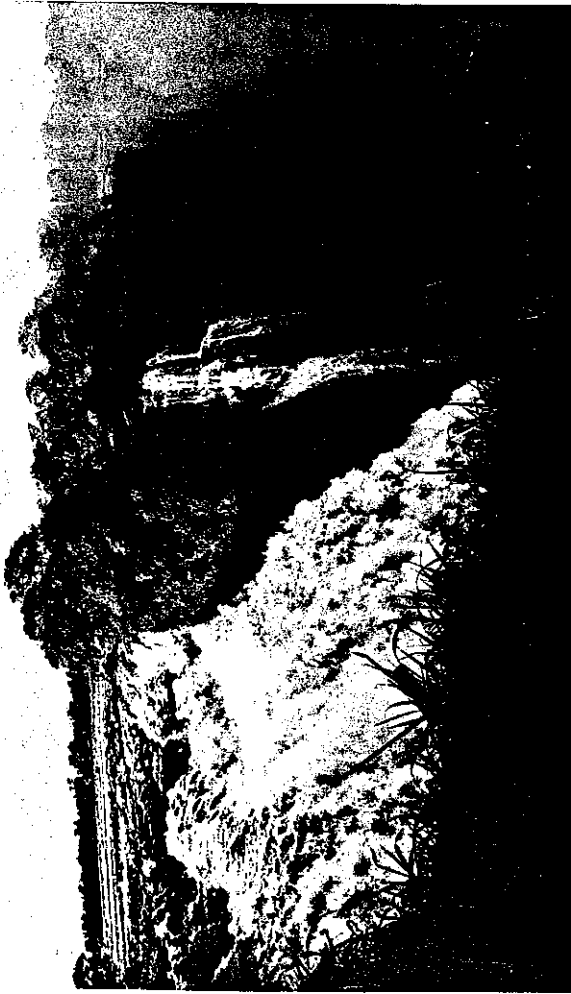
Playful halo from Devil's Cataract teases a photographer and his assistant who came prepared for the drenching mist of Victoria Falls. No photographs,

thought this was where the government should begin. For its part the government has asked commercial farmers to help with black farmers' plowing in the TTLs. In addition, the master farmers training program is being expanded. "On the surface this looks collaborating with the system we have fought," Eddison Zvobgo said to me, "but people who want land will get it."