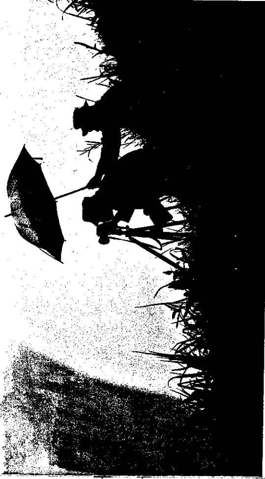
though, ever capture the sound and fury of the Zambezi River that—like the power of Zimbabwe in its second year—may be beautiful or perilous.

new force. Talks on merging ZAPU and ZANU were begun last November.