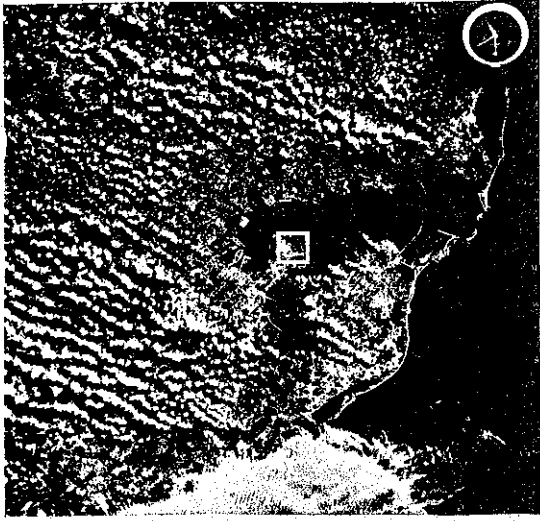
80TH AIRLAD 3; ENLARGEMENT (LEFT) COURTESY TECHNICIAN, WAC

H IGH-FLYING EYE yields bold detail in a striking enlargement of Skylab's imagery. The frame above shows Florida's Tampa Bay. MacDill Air Force Base appears as an angular speck on the Interbay Peninsula, extending into the bay at center. Clock shows time and sequence of the photograph.