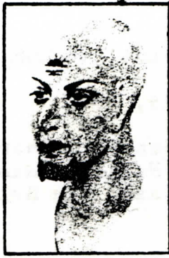
E YADA DI SHI' ITE

This personality was born in the city of Kaoti (City of Temples) in a civilization called Yuga (Vast Body), or Yu. This civilization consisted of 180 million people and existed a half million years ago. It was located in the Himalayan Mountains. He was taken from his mother as a baby and raised in the temples, to become a Kata (Priest) and later High Priest or Yada. The word really means "Spirit Life": He was therefore one of the heads of a mystical order called "Shi Ite".