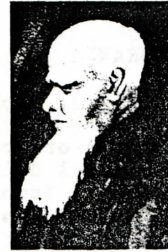
LAO-TSE or LAO-TZU

The "Yu" civilization had been founded by a man named Na Sep Ni Ha, meaning the seventh son of a family named "Ha". E Yada was killed in a violent quake that completely destroyed the civilization along with eighty million of its inhabitants. E Yada was about thirty-four when he died and the "Yu" civilization one thousand and twenty-four when it died.