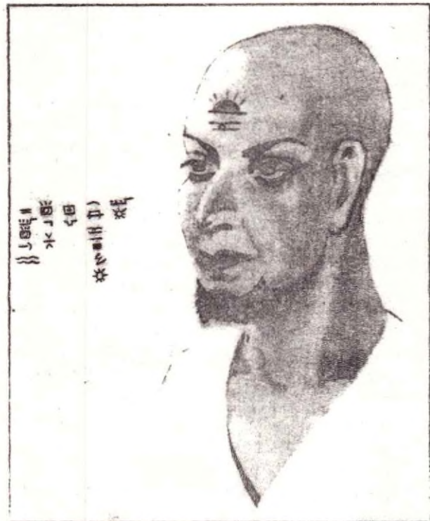
The Yada di Shi'ite