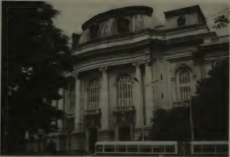
Figure 2.4. The University of Sofia (founded in 1888 the buildings date from 1934).

was set aside for the performance of simple plays based on the lesson dialogues.