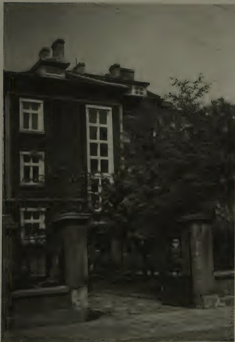
Figure 2.1. The Research Institute of Suggestology, 9 Budapest Street, Sofia (in 1971).