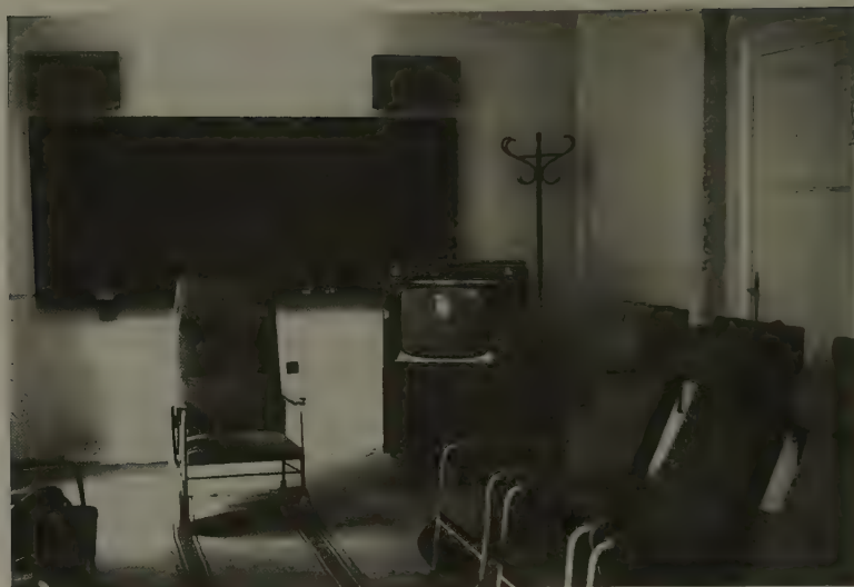
Figure 2.2. A small language classroom (with special chairs) in the Institute of Suggestology.